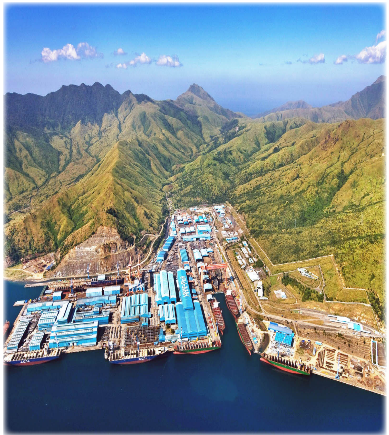
Hanjin shipyard at the Subic Bay Freeport Zone