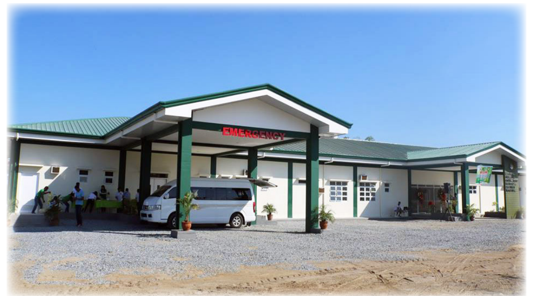
Binuksan na ng pamahalaang panlalawigan ang First District Hospital sa barangay San Julian, Moncada upang mas maipalapat ang pagbibigay ng serbisyong medikal sa mga residente ng hilagang bahagi ng Tarlac.

LUNGSOD NG TARLAC -- Binuksan na ng pamahalaang panlalawigan ang First District Hospital sa barangay San Julian, Moncada upang mas mallapit ang pagbibigay ng serbisyong medikal sa mga residente ng hilagang bahagi ng Tarlac.