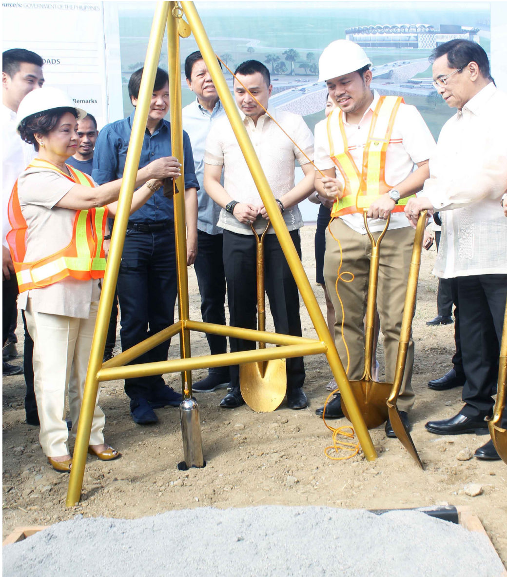
Pinangunahan nina House Speaker Gloria Macapagal-Arroyo (kaliwa) at Public Works and Highways Secretary Mark Villar (pangalawa mula kanan) ang Groundbreaking Ceremony para sa Ciudad de Victoria Interchange ng North Luzon Expressway.

BOCAUE, Bulacan -- Pinangunahan nina House Speaker Gloria Macapagal-Arroyo at Public Works and Highways Secretary Mark Villar ang Groundbreaking Ceremony para sa Ciudad de Victoria Interchange ng North Luzon Expressway o NLEX.