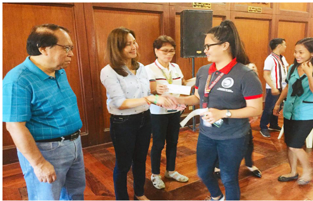
Nagbigay tulong at alalay ang Department of Labor and Employment katuwang ang Pamahalaang Panlalawigan sa may 113 estudyante sa Tarlac na tumanggap ng kanilang mga tseke sa ilalim ng Special Program for the Employment of Students.

LUNGSOD NG TARLAC-- May kabuuang 113 estudyante sa Tarlac ang tumanggap ng mga tseke mula sa Department of Labor and Employment o DOLE matapos maging benepisaryo ng Special Program for the Employment of Students o SPES.