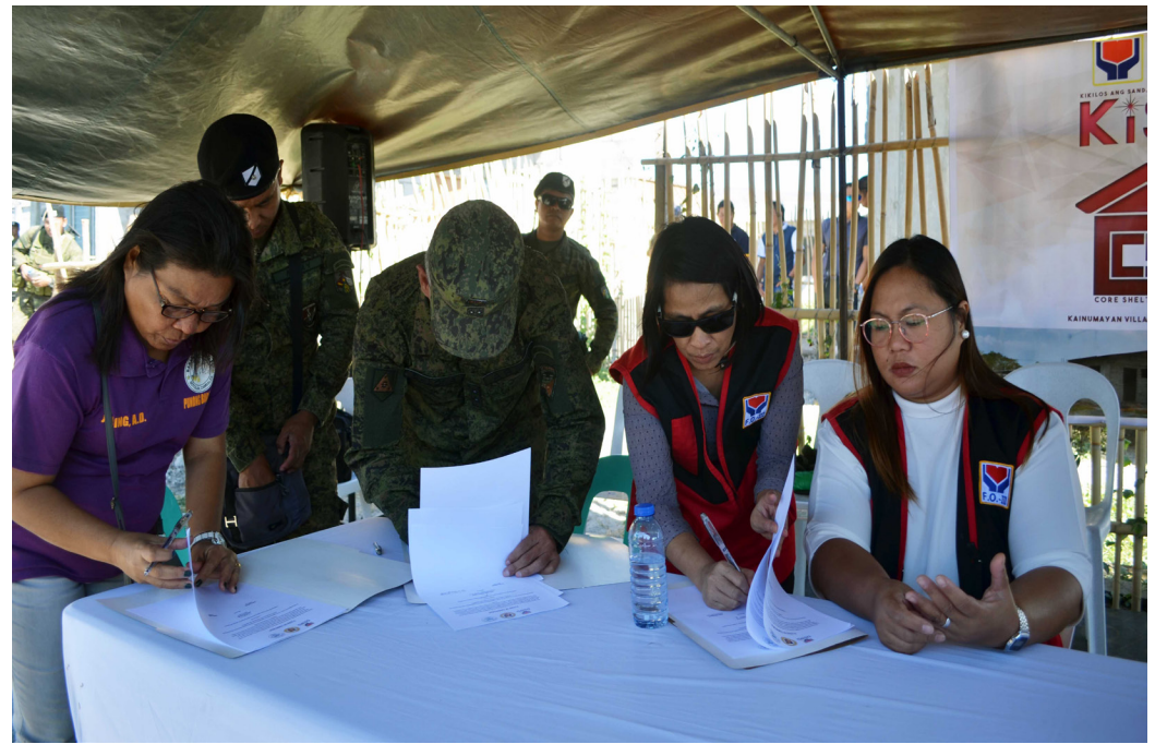
Pumirma ng kasunduan ang Department of Social Welfare and Development at Armed Forces of the Philippines para sa pagkumpleto sa proyektong pabahay sa Kainomayan Village sa Botolan, Zambales.

IBA, Zambales -- Tutulong ang Armed Forces of the Philippines o AFP sa pagkumpleto sa proyektong pabahay ng Department of Social Welfare and Development o DSWD sa bayan ng Botolan.