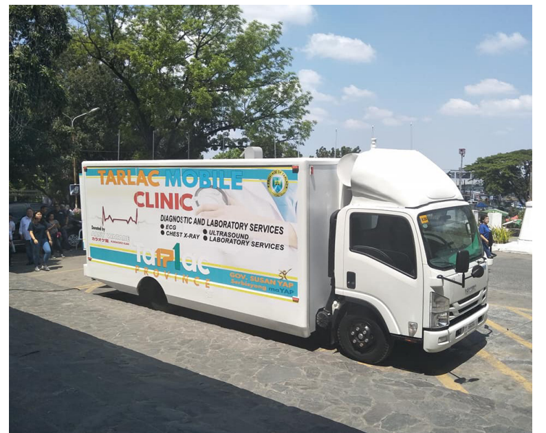
Tumanggap ng isang bagong diagnostic van ang Pamahalaang Panlalawigan upang makapaghatid ng mas mataas na antas ng serbisyong medikal sa mga Tarlakenyo. Ito ay may kumpletong kagamitan para sa ultrasound, x-ray, electrocardiogram at laboratory services. (Gerry G. Gomez)

turang van ay may kumpletong kagamitan para sa ultrasound, x-ray, electrocardiogram at laboratory services.