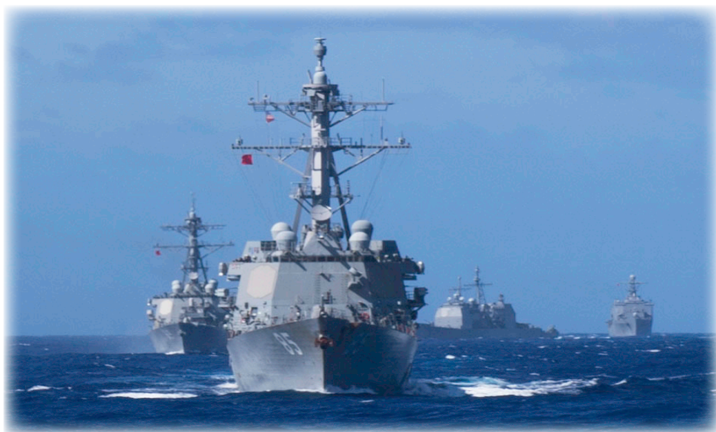
PHILIPPINE SEA. The Arleigh Burke-class guided-missile destroyer USS McCambell (DDG 85), Arleigh Burke-class guided-missile destroyer USS Milius (DDG 69), Ticonderoga-class guided-missile cruiser USS Chancellorsville (CG 62), and the amphibious dock landing ship USS Ashland (LSD 48) maneuver while operating in the Philippine Sea. U.S. Navy warships train together to increase the tactical proficiency, lethality, and interoperability of participating units in an Era of Great Power Competition.