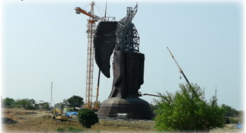
The 51-meter high Saint Vincent Ferrer statue made of bamboos being constructed at barangay Bani in Bayambang, Pangasinan is near completion. This will be inaugurated on Apr. 5, 2019, in time for the 400th founding anniversary of the St. Vincent Ferrer Parish Church in Bayambang and the 600th year death anniversary of Saint Vincent Ferrer.

Manila Water, the concessionaire for the east zone, has been implementing water interruptions in several areas to ensure that the water supply can last until June. It covers the cities of Mandaluyong, Pasig, San Juan, Taguig, and Marikina; the municipality of Pateros; parts of Makati, Manila, and Quezon City; and the towns of Angono, Baras, Binangonan, Cainta, Cardona, Jalajala, Morong, Pililia, Rodriguez, Tanay, Taytay, Teresa, San Mateo and Antipolo in the province of Rizal.