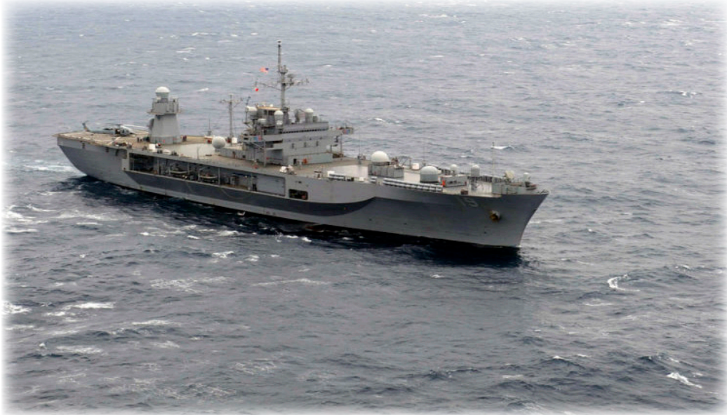
U.S. 7th Fleet flagship USS Blue Ridge (LCC 19) transits in the South China Sea in 2014.

Manila, March 13, 2019 — U.S. 7th Fleet flagship USS Blue Ridge (LCC 19) and embarked 7th Fleet staff arrived in Manila today for the ship's first port visit to the Philippines since 2016.