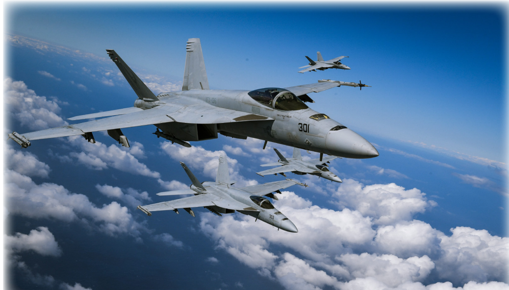
PACIFIC OCEAN. F/A-18E Super Hornets from Strike Fighter Squadron (VFA) 136 fly in formation during a photo exercise over California. VFA-136 is an operational U.S. Navy strike fighter squadron based at Naval Air Station Lemoore, Calif., and is attached to Carrier Air Wing (CVW) 1.