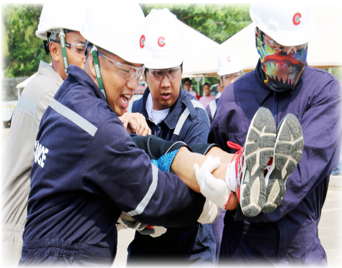
A rescue team from the Philippine Coastal Storage and Pipeline Corp. carries a "victim" during a rescue scenario in the Subic Fire Olympics 2019 held at the Subic Bay Gateway Park on March 29.