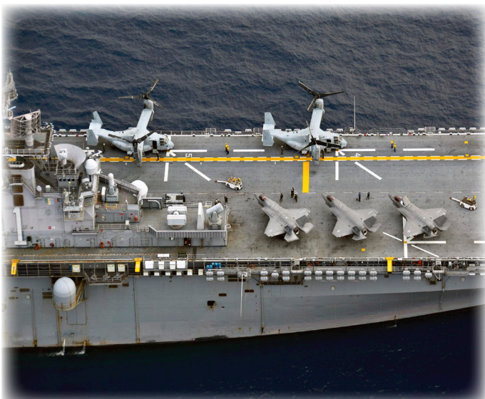
SUBIC BAY, Philippines. Sailors aboard the amphibious assault ship USS Wasp (LHD 1) man the rails while arriving in Subic Bay for Exercise Balikatan. Exercise Balikatan, in its 35th iteration, is an annual U.S., Philippine military training exercise focused on a variety of missions, including humanitarian assistance and disaster relief, counter-terrorism, and other combined military operations.

Balikatan demonstrates their ability to quickly forward deploy in support of an ally should a crisis or natural disaster occur.