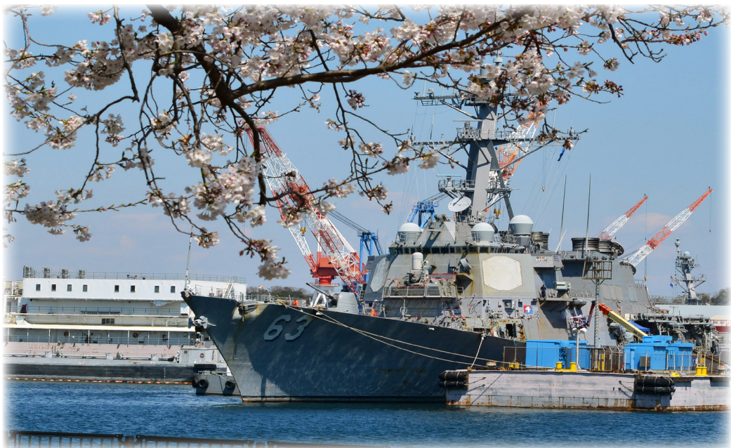
YOKOSUKA, Japan. The Arleigh Burke-class guided-missile destroyer USS Stethem (DDG 63) is moored at Fleet Activities (FLEACT) Yokosuka, April 4, 2019. FLEACT Yokosuka provides, maintains, and operates base facilities and services in support of the U.S. 7th Fleet's forward-deployed naval forces, 71 tenant commands, and more than 27,000 military and civilian personnel.