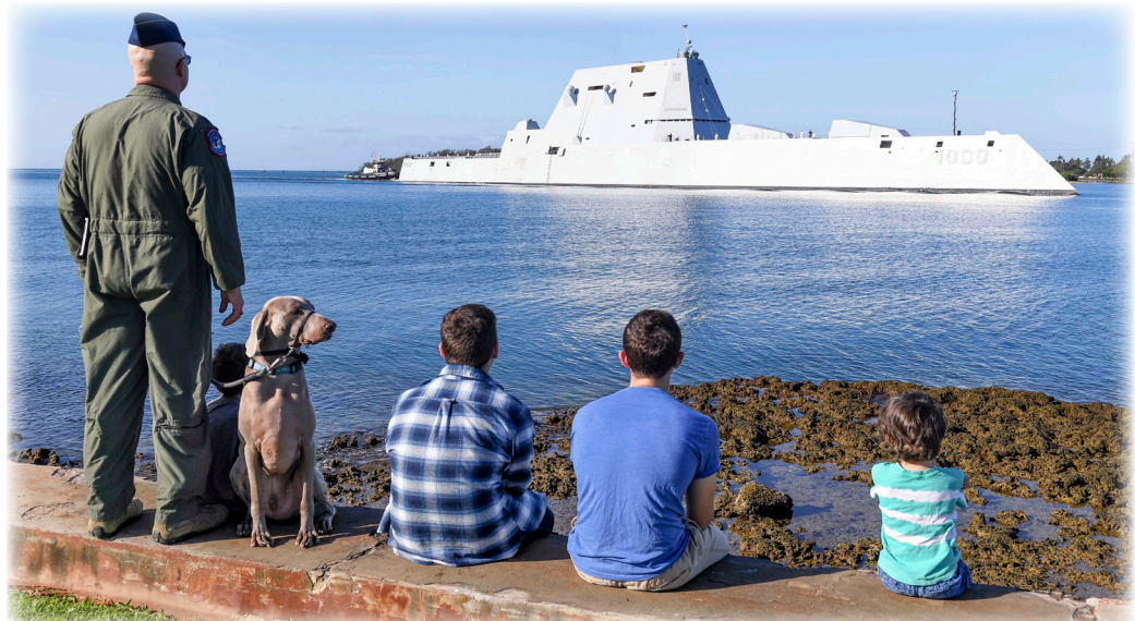
PEARL HARBOR. Sailors man the rails aboard the guided-missile destroyer USS Zumwalt (DDG 1000) as the ship pulls into Joint Base Pearl Harbor-Hickam. Zumwalt-class destroyers provide the Navy with agile military advantages at sea and with ground forces ashore.