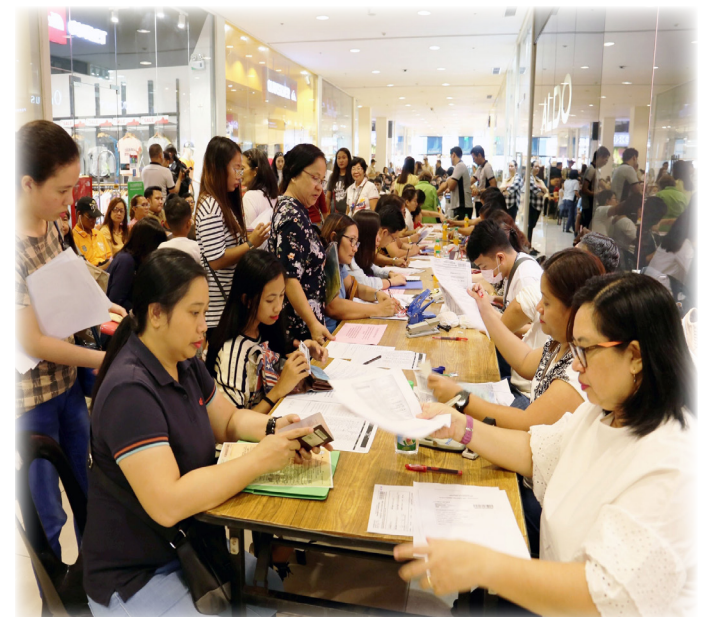
Hundreds of applicants queue for the processing of their passport during the DFA-SBMA Passport on Wheels project at the Harbor Point Ayala Mall on March 29, ample proof that a consular office is needed to serve the public in the Subic Bay Freeport area.

SUBIC BAY FREEPORT —The Department of Foreign Affairs (DFA) is now considering the establishment of a permanent consular office in this free port to better serve the public in the Subic Bay area and nearby parts of Central Luzon.