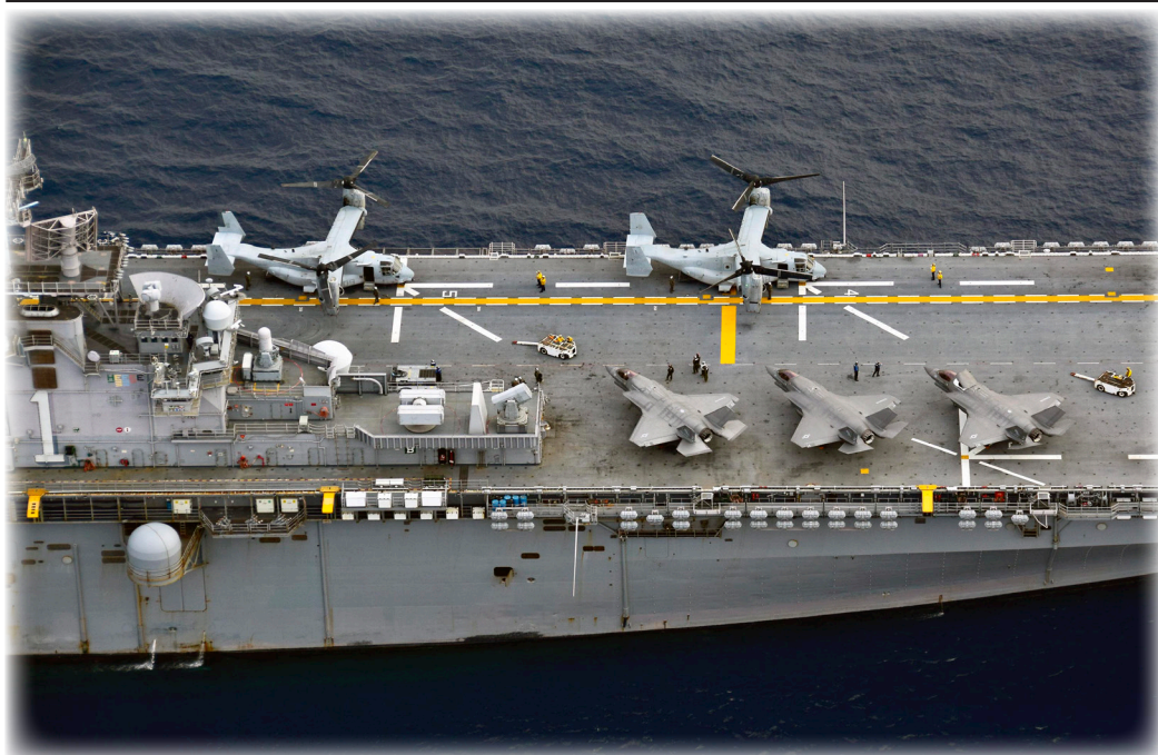
PHILIPPINE SEA. F-35B Lightning II aircraft assigned to Marine Fighter Attack Squadron (VMFA) 121 and MV-22 Ospreys tilt-rotor aircraft assigned to Marine Medium Tiltrotor Squadron (VMM) 268 are secured to the flight deck of the amphibious assault ship USS Wasp (LHD 1). Wasp, flagship of Wasp Amphibious Ready Group, is operating in the Indo-Pacific region to enhance interoperability with partners and serve as a lethal ready-response force for any type of contingency.