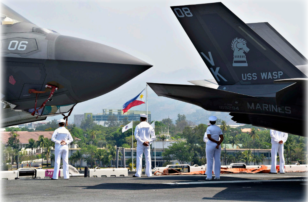
SUBIC BAY, Philippines. Sailors aboard the amphibious assault ship USS Wasp (LHD 1) man the rails while arriving in Subic Bay for Exercise Balikatan. Exercise Balikatan, in its 35th iteration, is an annual U.S., Philippine military training exercise focused on a variety of missions, including humanitarian assistance and disaster relief, counter-terrorism, and other combined military operations.