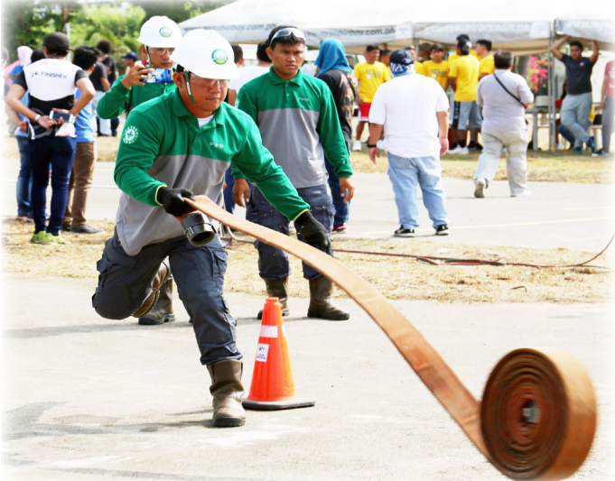
A fire brigade member from Pure Petroleum Corp. unrolls a fire hose during a Subic Fire Olympics 2019 competition held at the Subic Bay Gateway Park on March 29.