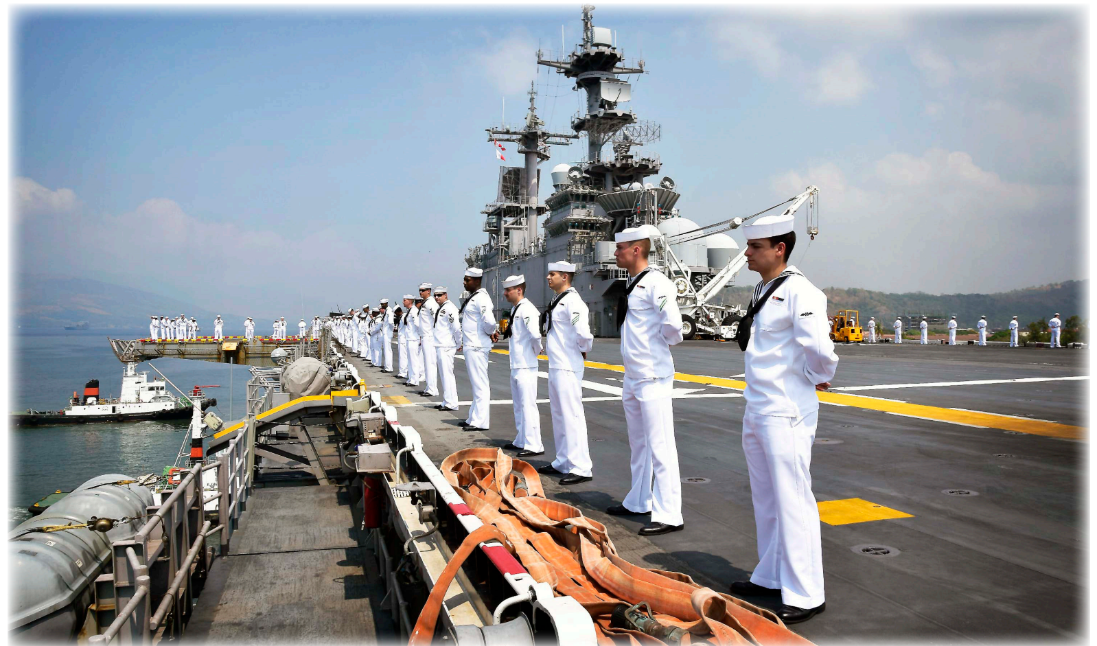
SUBIC BAY, Philippines. Sailors aboard the amphibious assault ship USS Wasp (LHD 1) man the rails while arriving in Subic Bay for Exercise Balikatan. Exercise Balikatan, in its 35th iteration, is an annual U.S., Philippine military training exercise focused on a variety of missions, including humanitarian assistance and disaster relief, counter-terrorism, and other combined military operations.