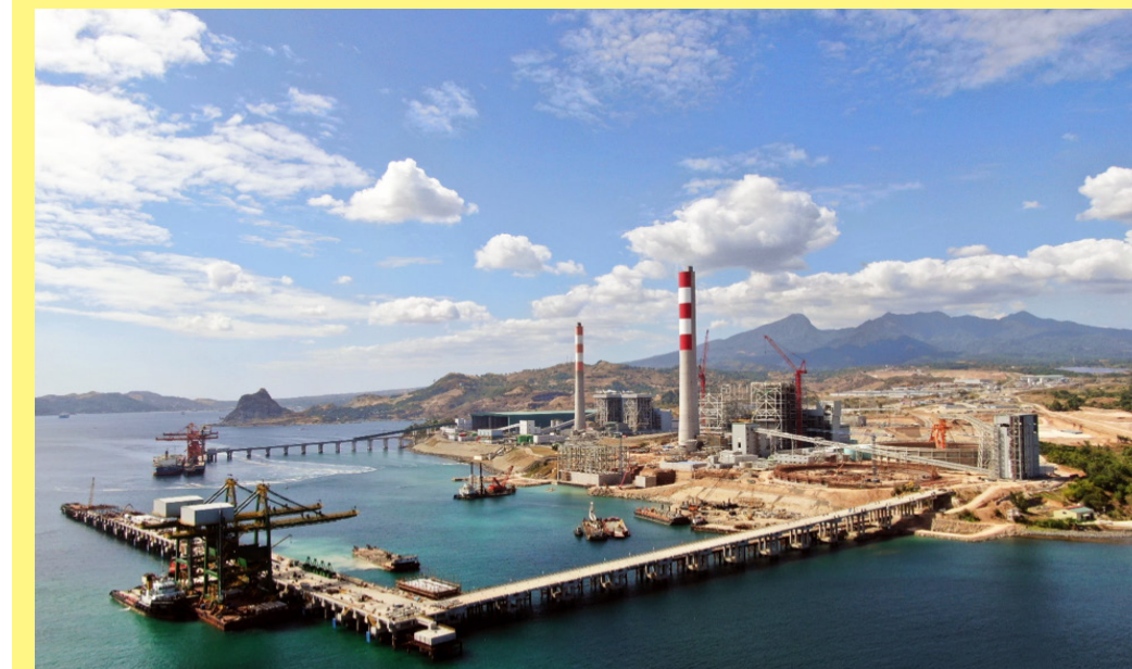
With its first unit coming online later this year, GNPowder Dinginin seeks to help stabilize power supply in the grid.

Aboitiz Power Corporation (AboitizPower) completed its acquisition of a 49% voting stake and a 60% economic stake in AA Thermal, Inc., AC Energy's thermal platform in the Philippines.