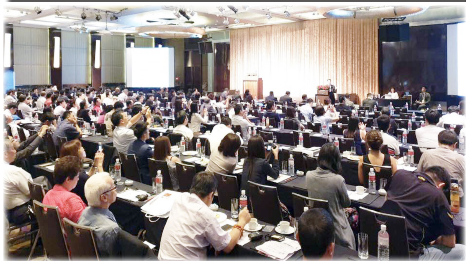
] More than 250 Taiwanese investors attended the Philippine Investment Forum organized by the Philippine Investment Promotion Plan (PIPP) in coordination with the Philippine Trade and Investment Center (PTIC)-Taipei.

Eisma said most of the incoming Taiwanese investors will locate at the Tipa area, which is being developed by the SBMA as a major industrial site