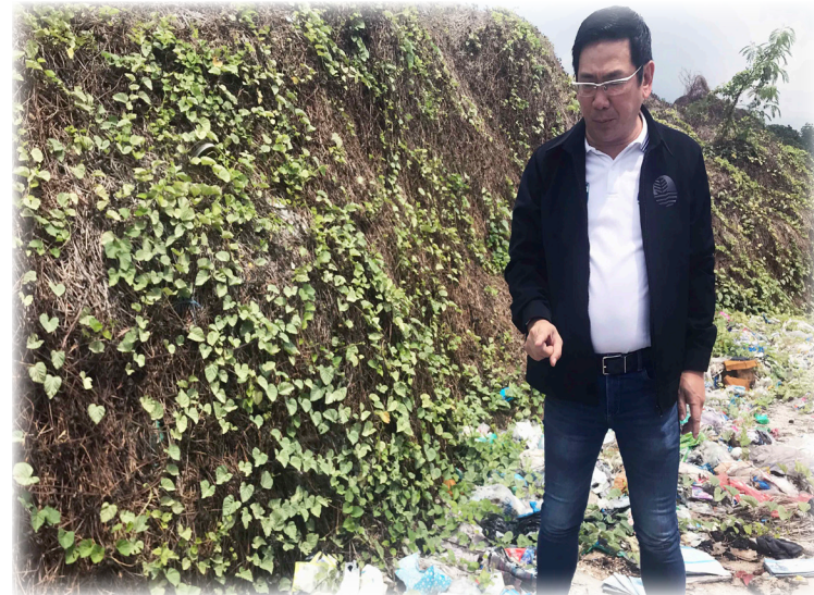
OPEN DUMPSITE INSPECTION. Undersecretary Benny Antiporda of the Department of Environment and Natural Resources explains the ill effects of using the open dumpsite in Limay, Bataan on Wednesday (May 8, 2019). The inspection is part of the government's effort to protect and rehabilitate the environment.

LIMAY, Bataan -- The Department of Environment and Natural Resources (DENR) said it will issue a cease-and-desist order against an open dumpsite in a village here after inspection Wednesday.