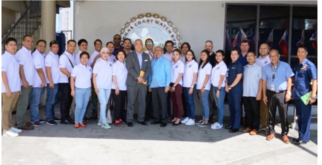
Participants from the Bureau of Customs, Bureau of Immigration, and Philippine Coast Guard visited the National Coast Watch Center with course trainers.

Manila — The U.S. Embassy in the Philippines conducted a border security training with 19 officers from the Bureau of Customs, Bureau of Immigration, and Philippine Coast Guard from June 17 to 21. The training provided participants with a thorough understanding of the targeting and risk management process to help identify high-risk shipments as well as high-risk persons entering the country.