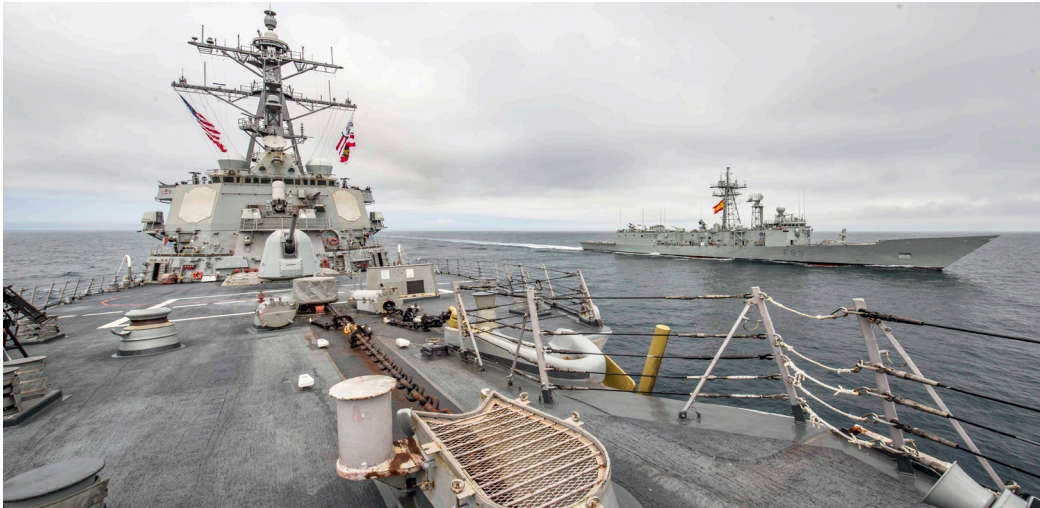
ATLANTIC OCEAN. The Arleigh Burke-class guided-missile destroyer USS Carney (DDG 64) transits through the Atlantic Ocean with the Santa Maria-class Spanish frigate Numancia (F83) during a war-at-sea exercise, June 24, 2019. Carney, forward-deployed to Rota, Spain, is on its sixth patrol in the U.S. 6th Fleet area of operations in support of regional allies and partners as well as U.S. national security interests in Europe and Africa.