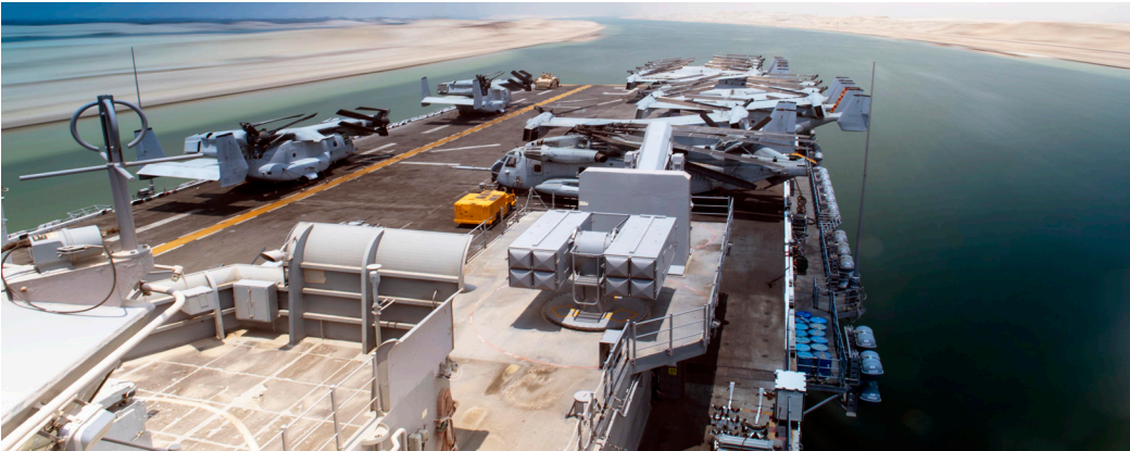
SUEZ CANAL. The Wasp-class amphibious assault ship USS Kearsarge (LHD 3) transits the Suez Canal. Kearsarge is the flagship for the Kearsarge Amphibious Group and, with the embarked 22nd Marine Expeditionary Unit, is deployed to the U.S. 5th Fleet area of operations in support of naval operations to ensure maritime stability and security in the Central Region, connecting the Mediterranean and the Pacific through the Western Indian Ocean and three strategic choke points.