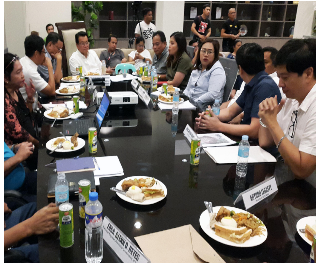
Nagpulong sa Kapitolyo ang iba't ibang ahensiya ng pamahalaang nasyonal, pamahalaang panlalawigan, mga pamahalaang bayan at pribadong sektor upang resolbahin ang kasalukuyang usapin tungkol sa pagtatapunan ng basura ng mga pampublikong ospital sa Bulacan.

LUNGSOD NG MALOLOS-- Nakahanap na ng alternatibong pagtatapunan ng basura mula sa mga district hospitals ang Pamahalaang Panlalawigan ng Bulacan matapos mahinto ang operasyon ng Wacuman o ang Waster Custodial Management Inc. na nakabase sa Norzagaray.