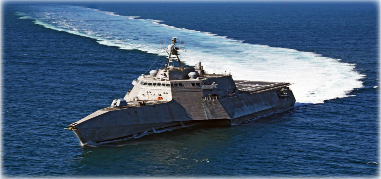
USS Montgomery (LCS 8) transits the Pacific Ocean to conduct routine operations and training.

Manila — The Independence-class littoral combat ship USS Montgomery (LCS 8) arrived in Davao City on June 29 for the ship's first port visit to the Philippines during her first deployment.